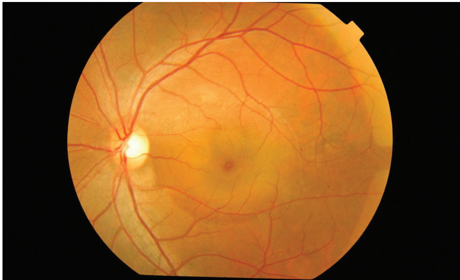
Color fundus photograph of left eye of a 33-year-old man with bilateral CSC. Mallika Goyal, MD, Apollo Health City, India. Central serous chorioretinopathy. Retina Image Bank 2012; Image 2117. ©American Society of Retina Specialists.

CSC most often occurs in young and middle-aged adults. For unknown reasons, men develop this condition more commonly than women. Vision loss is usually temporary but sometimes can become chronic or recur.