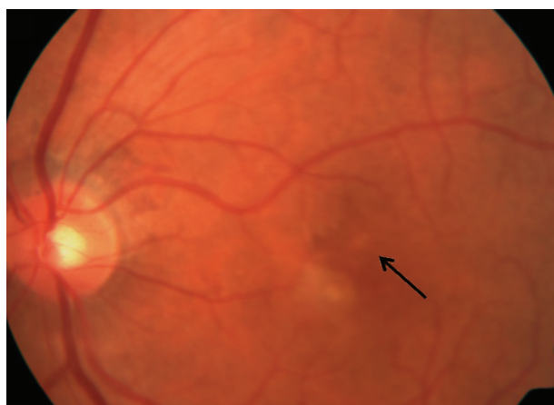
Figure 2 Wet AMD. Choroidal neovascularization (indicated by arrow).

CNV occurs when abnormal blood vessels grow beneath the retina; these can bleed or leak and cause a distortion of