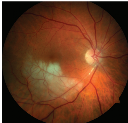
Figure 2 Branch retinal vein occlusion (BRAO) showing retinal whitening in the area of blockage.