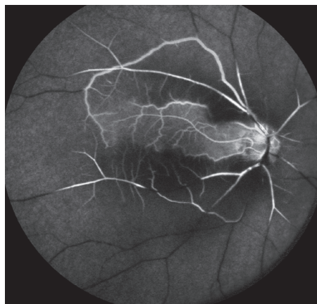
Figure 3 Fluorescein angiogram of CRAO showing sparing of the cilioretinal artery.